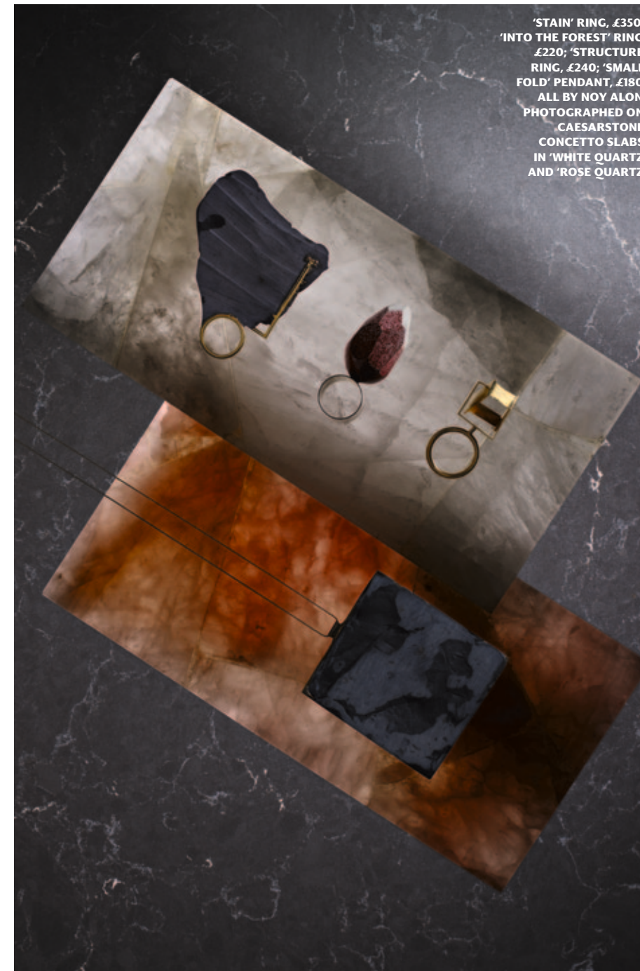
'STAIN' RING, £350; 'INTO THE FOREST' RING, £220; 'STRUCTURE' RING, £240; 'SMALL FOLD' PENDANT, £180, ALL BY NOY ALON, PHOTOGRAPHED ON CAESARSTONE CONCETTO SLABS IN 'WHITE QUARTZ' AND 'ROSE QUARTZ'