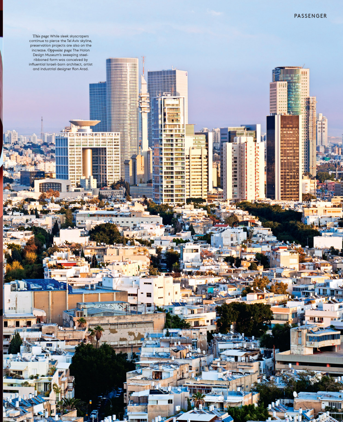
(TEL AVIV SKYLINE)

This page While sleek skyscrapers continue to pierce the Tel Aviv skyline, preservation projects are also on the increase. Opposite page The Holon Design Museum's sweeping steel-ribbed form was conceived by influential Israeli-born architect, artist and industrial designer Ron Arad.