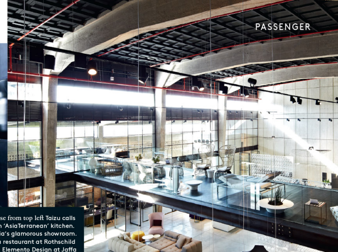
Clockwise from top left Taizu calls itself an 'AsiaTerraean' kitchen. B&B Italia's glamorous showroom. Cantina restaurant at Rothschild 71 hotel. Elementa Design at Jaffa market. The Old Man and the Sea restaurant. Tapolopompo 'fire' restaurant serves smoking hot East Asian fare. Tel Aviv Museum of Art. B&B Italia.