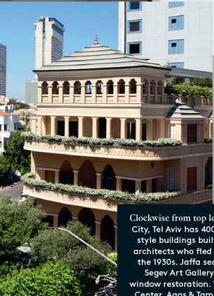
Clockwise from top left Aka White City, Tel Aviv has 4000 Bauhaus-style buildings built by Jewish architects who fled Germany in the 1930s. Jaffa seaport, Alon Segev Art Gallery, Graphic window restoration, The Bauhaus Center, Agas & Tamar Jewellery boutique in the creative Neve Zedek area. Luxe Norman Hotel.